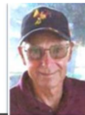
GOLF by Sir Stan Nappe

Laws of Golf: The shortest distant between two points on a golf course is a straight line that passes directly through the center of a very large tree. It's not a gimme if you are 4 feet away. It's surprisingly easy to hole a 30 foot for a 10.