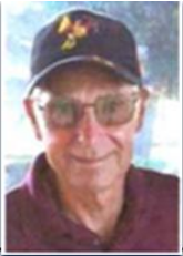
GOLF by Sir Stan Nappe